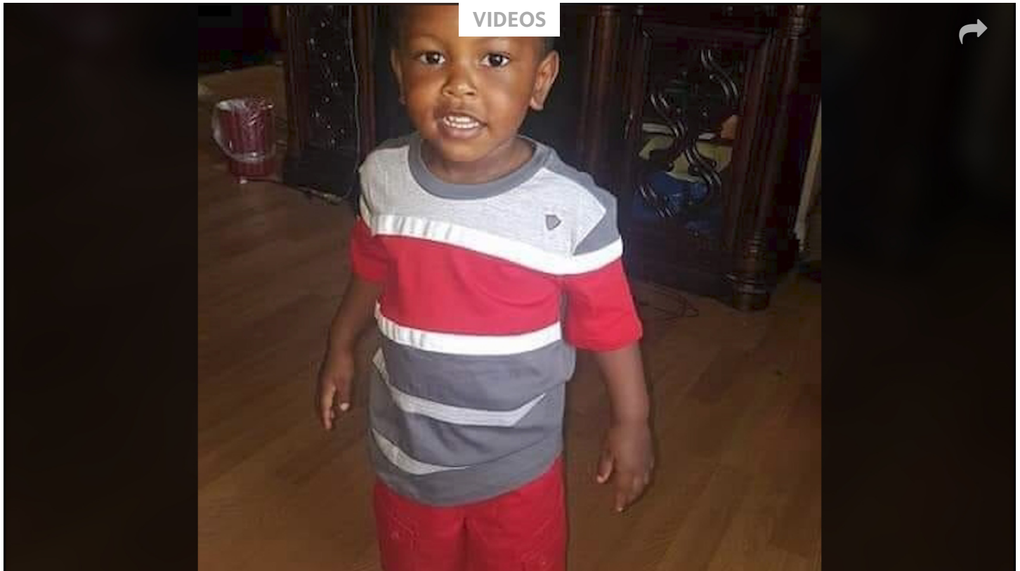
Lexington toddler who shot himself with family gun was a 'real-life superhero'