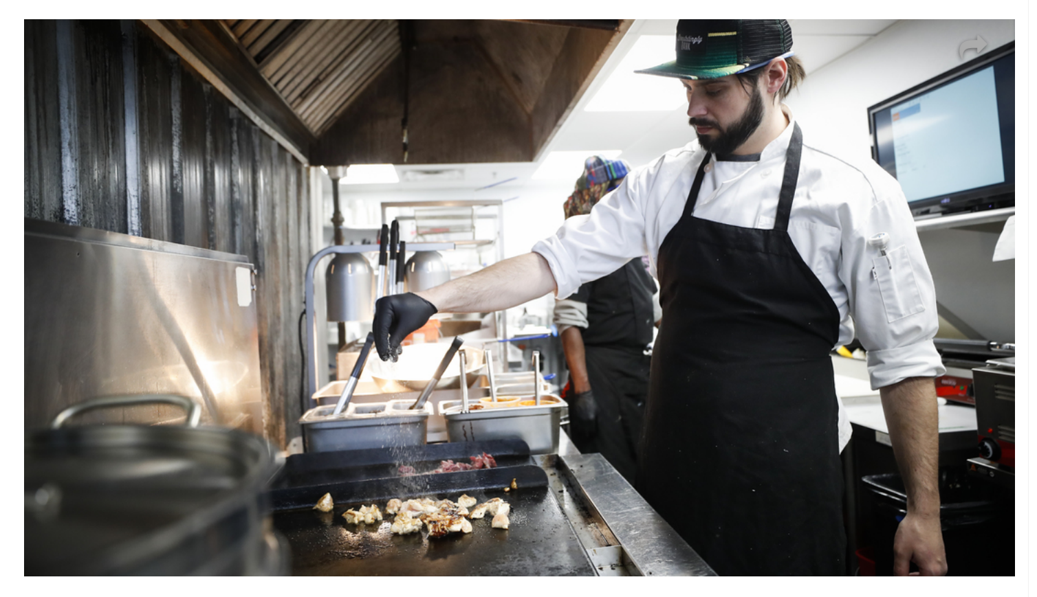
Ethereal Brewing and Bazaar Eatery open up amid coronavirus shutdown