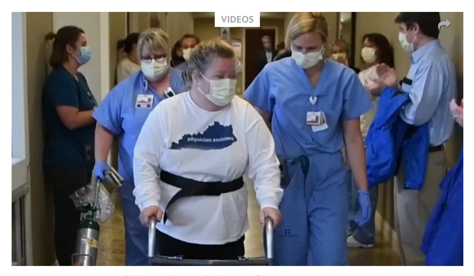
Lexington woman celebrates hospital release after COVID-19 recovery